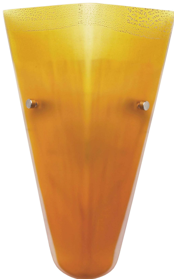
Shown with Topaz Shade with Satin Nickel Hardware

No two shades are exactly alike. There will always be variations, which are typical of a handmade product and contribute to its beauty.