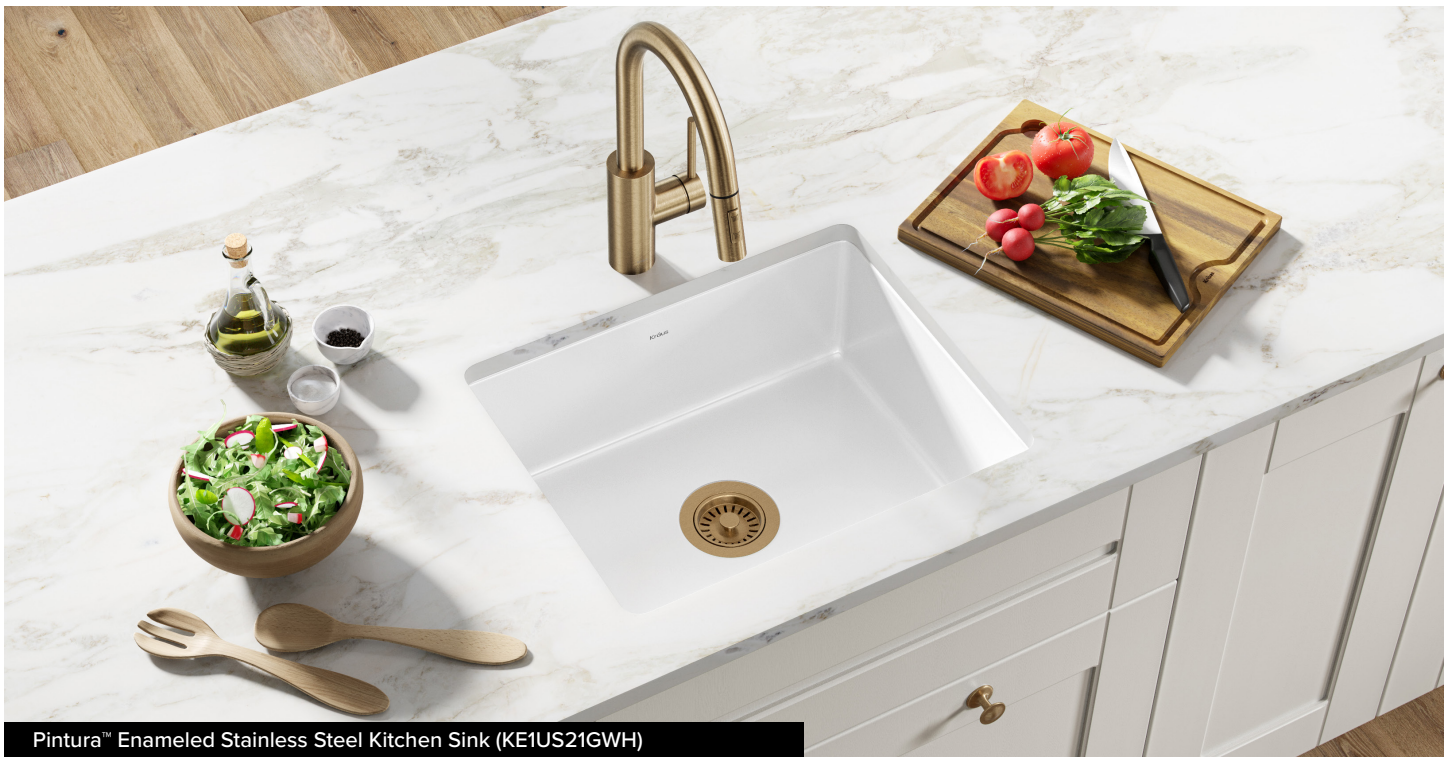
Pintura™ Enameled Stainless Steel Kitchen Sink (KE1US21GWH)