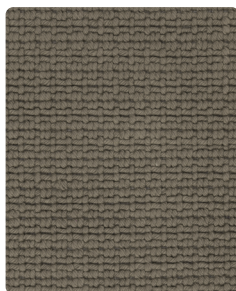
RN02 - Dark Beige