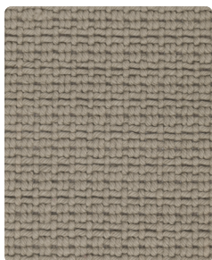
RN01 - Beige