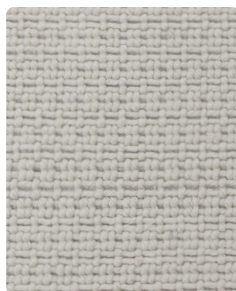
RN03 - Ivory