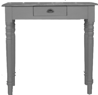
Fig no. 1