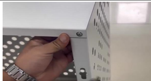
Step 6: There are reserved holes in the top plate, install the top panel with electric drill according to the reserved holes in the top plate.

Note: If you need a video, please feel free to contact us!