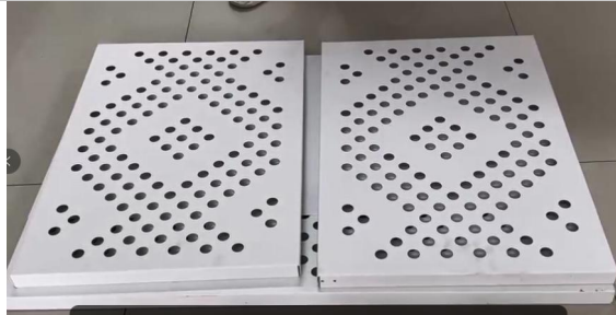
Step 1: Remove all the accessories