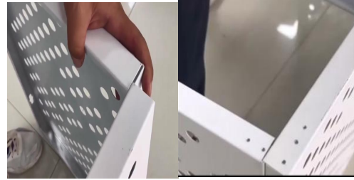
Step 2: Use gaps left in the panels. Interlace two sides and a front with each other. Assemble them together.