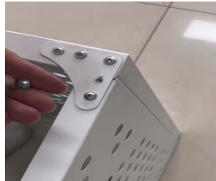
Step 4: In order to stabilize the installation, the triangular connecting piece needs to be installed at the left and right corners at the bottom. Attach two triangular aluminum plates to each of the two corners