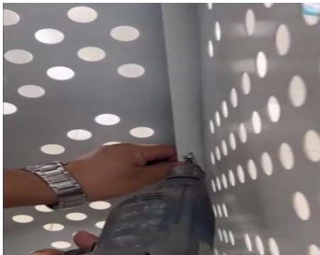
Step 3: There are four pre-drilled mounting holes on the inside. Then we use self-drilling screws to hold it in place.