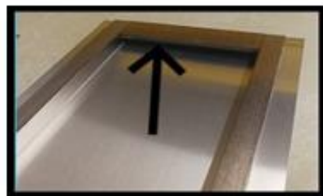
Lip for hanging over screw

For the single panel art, measure the distance between the first and second screw and repeat per number of desired screws.