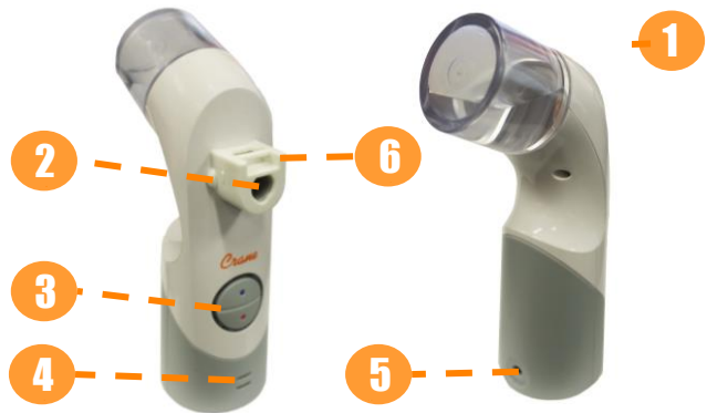
Fig. 2 (Other Parts)