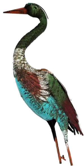
Crane Body 1x