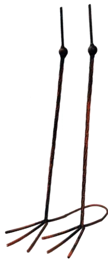
Crane Legs 1x