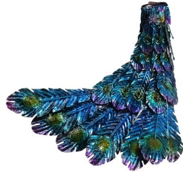
Peacock Tail 1x