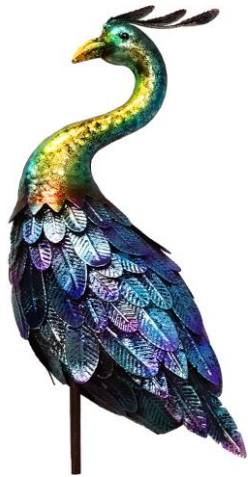
Peacock Body 1x