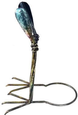
Peacock Legs 1x