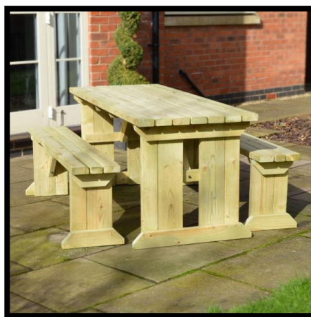
PICNIC TABLE AND BENCH SET