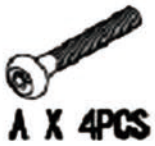
A X 4PCS