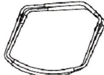
C X 1PC