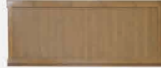
(k) Bottom Panel x 1 (With Slot)