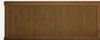
(l) Hinge Panel x 4 (Without Slot)