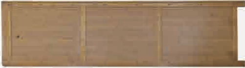
(a) Left Side Frame x 1