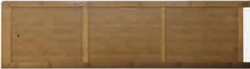
(b) Right Side Frame x 1