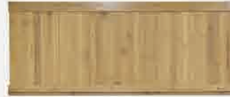
(j) Top Panel x 1