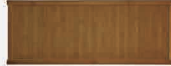
(m) Panel x 4 (Without Slot, Smaller than Hinge Panel (l))