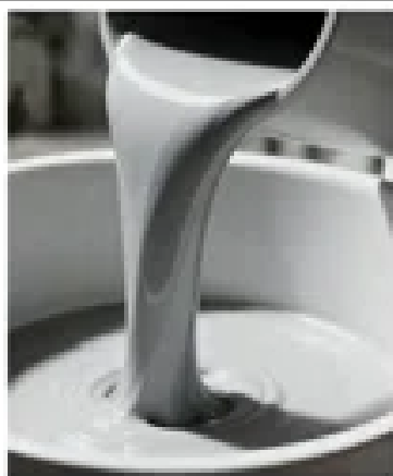
One-Piece Mold Casting

Independent QC · \mu\text{m} Precision at Every Stage