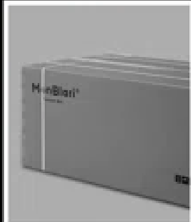
Thickened Carton Packaging