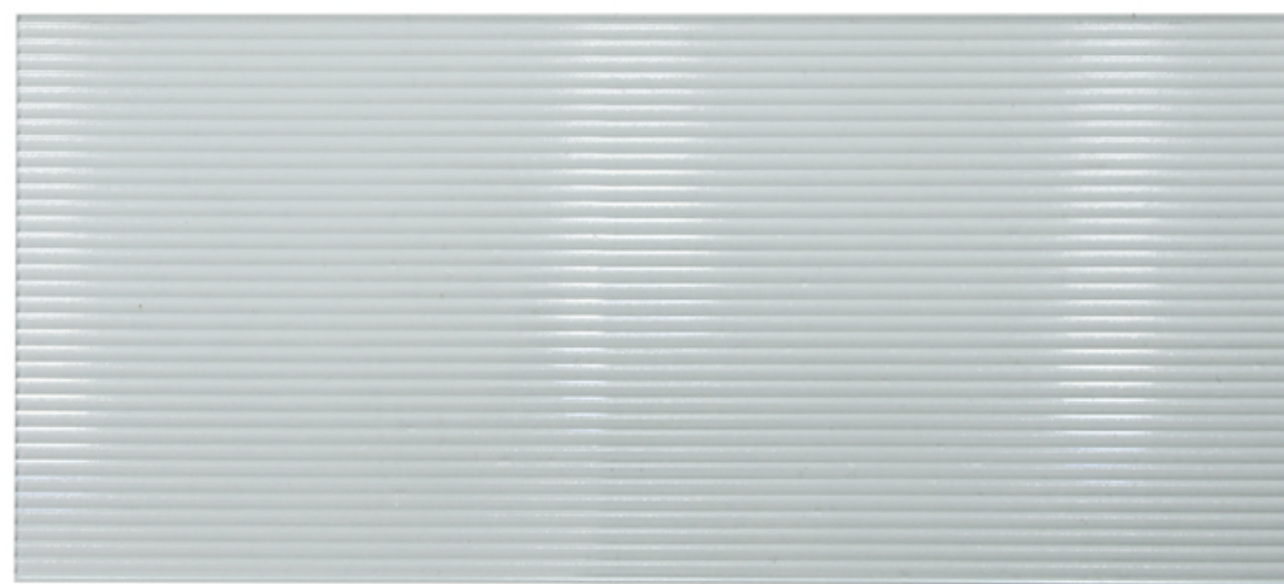
Glass Table Top x 1