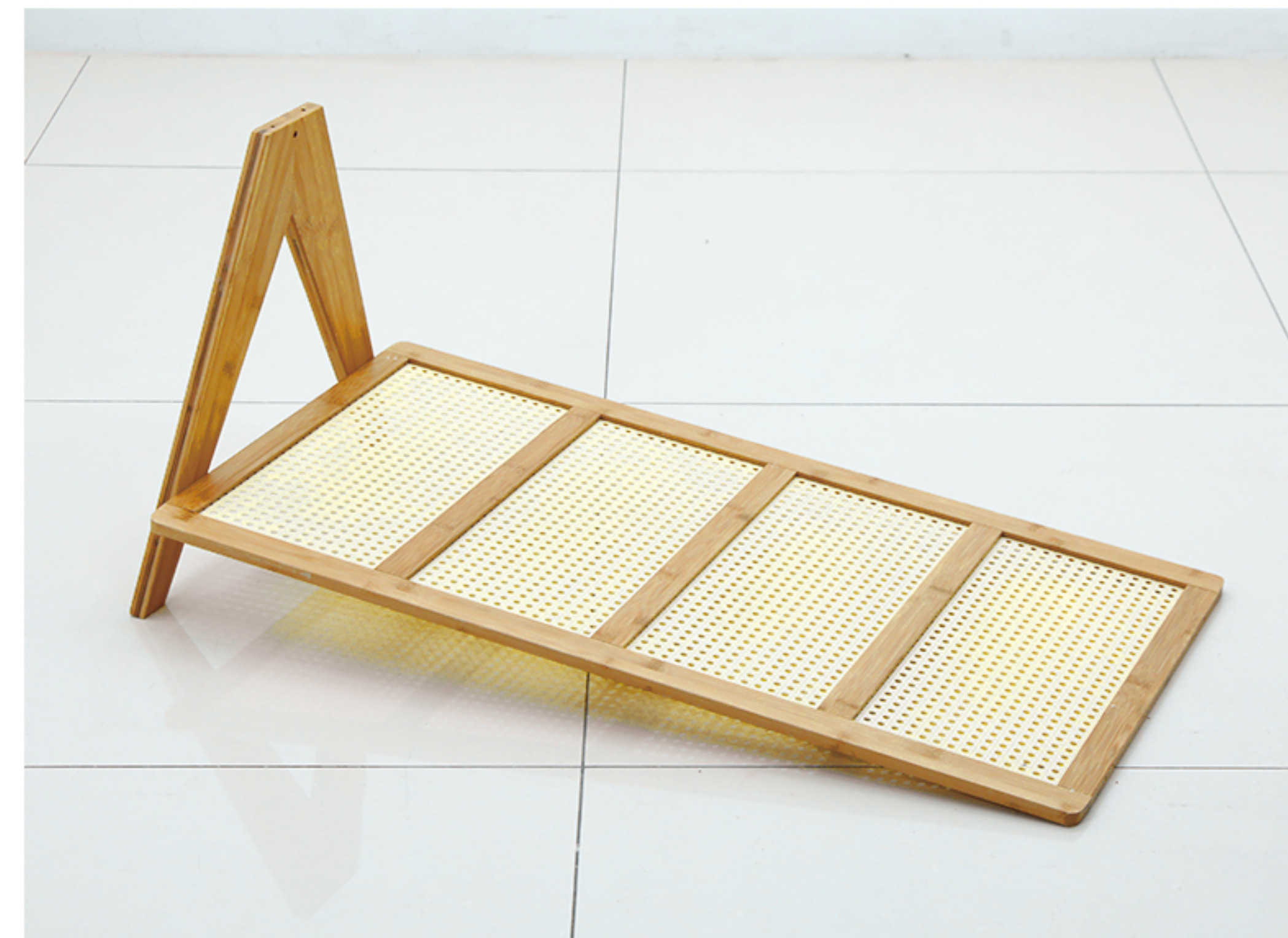
1. Connect the side support and the board with screws.