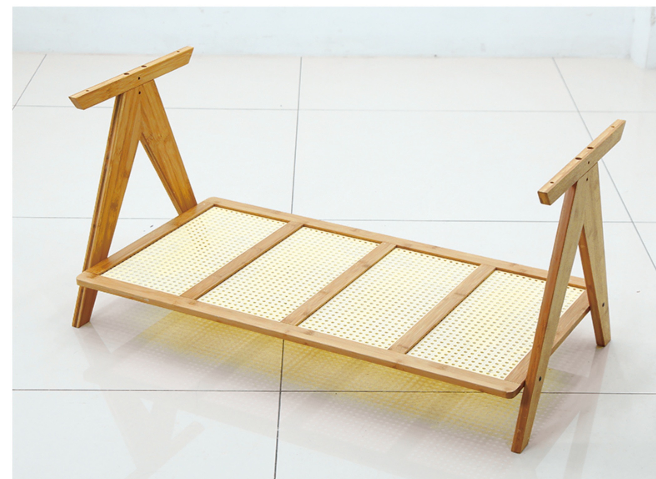
3. Attach the side bar to the side support with screws