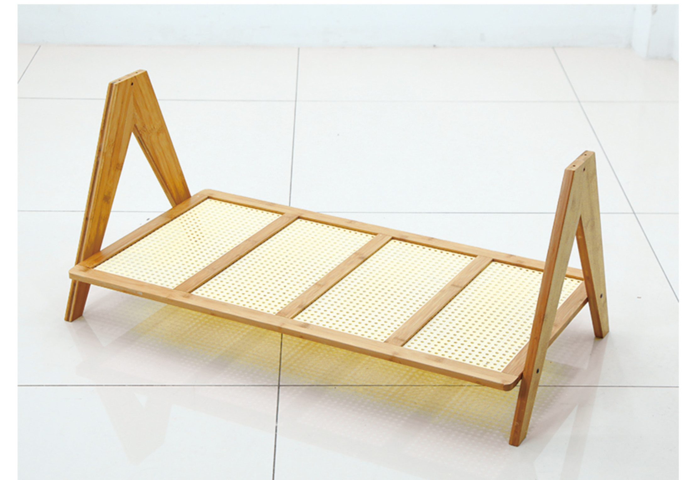
2. Attach the other side support to the board with screws.