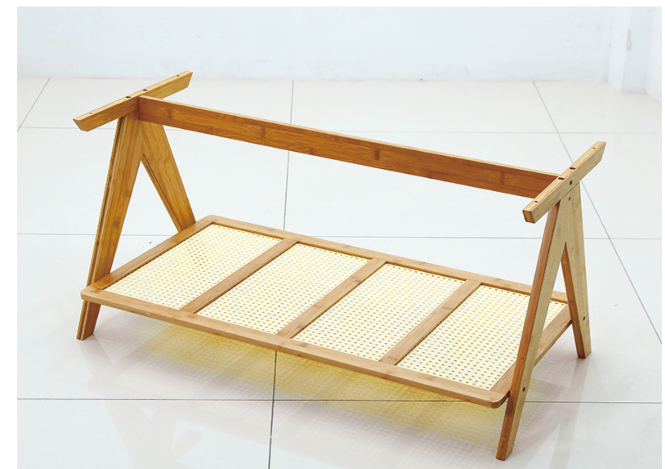
4. Attach the bar to the side support and the side bar with screws .