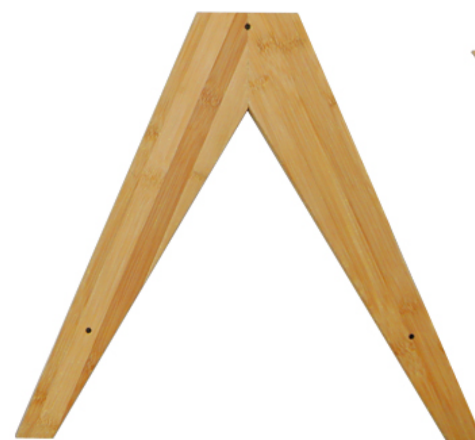
Side Support x2