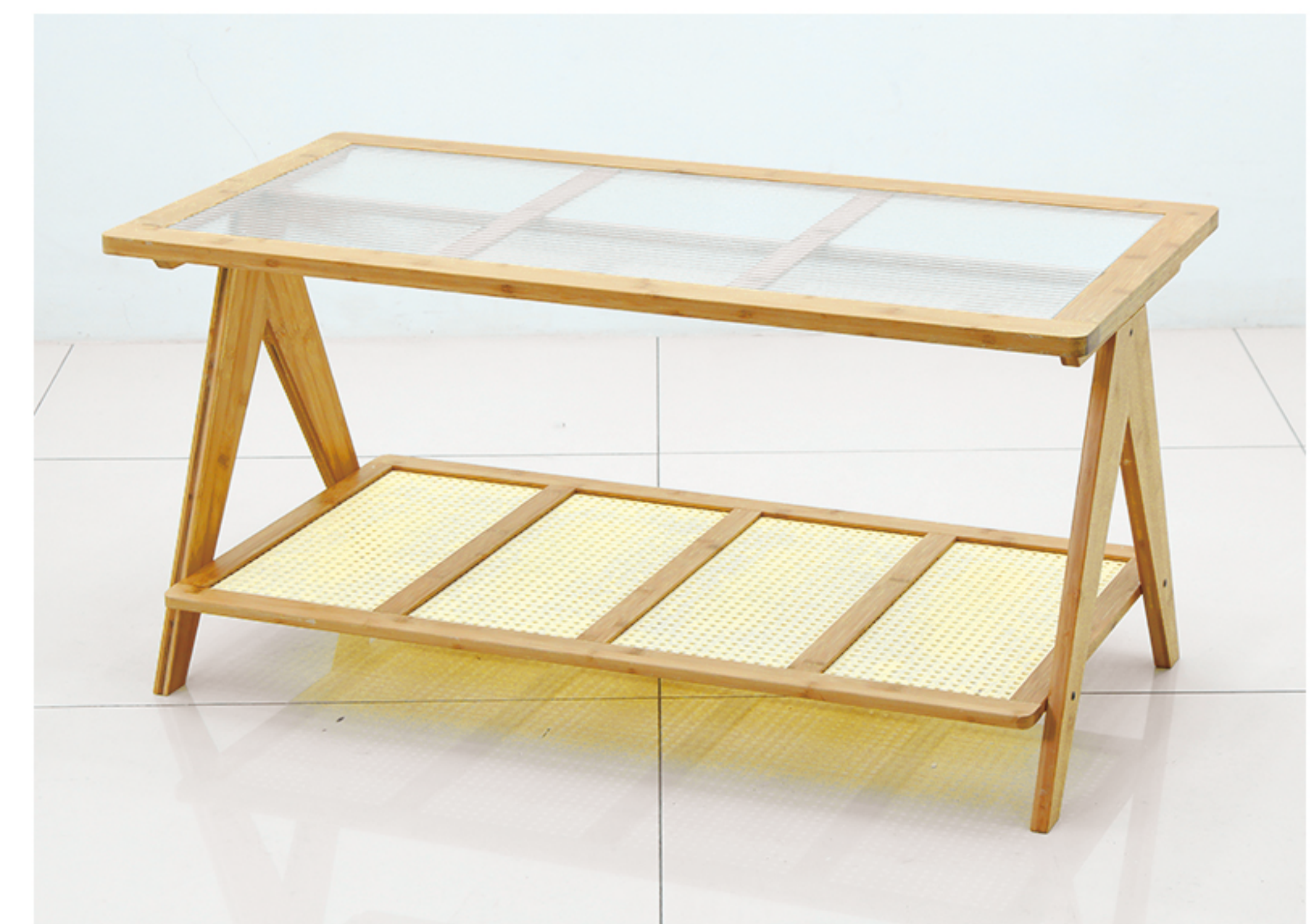
6. Place the glass top on the frame.