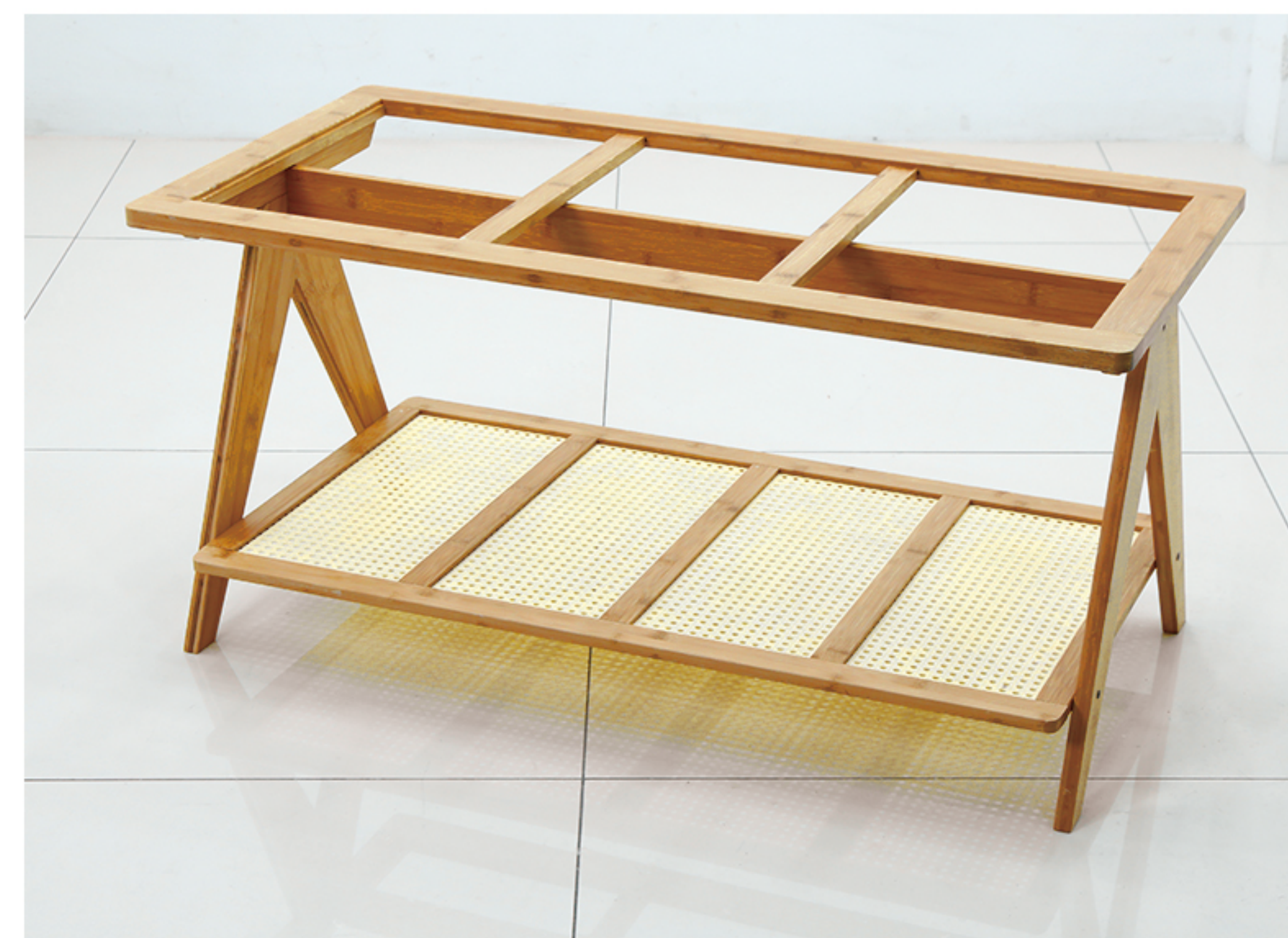
5. Fix the frame on top of the side bar with screws.