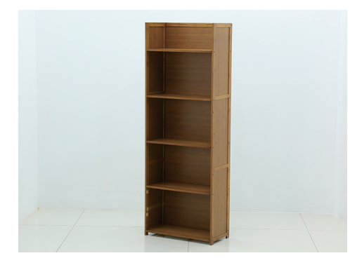
6 Secure Back Support Slat (c) with Screws (g).