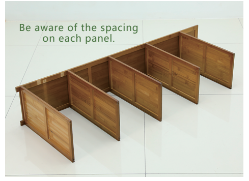
① Position Left Side Frame (a) and Panels (d) as picture shown. Secure with Screws (g). (Keep Grooves Aligned)