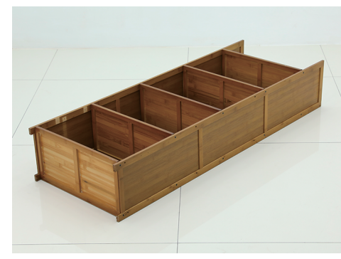
4 Secure Right Side Frame (b) with Screws (g).