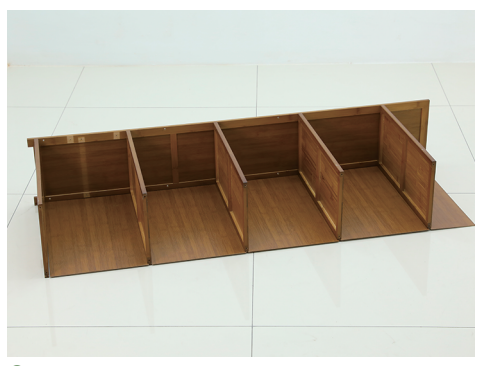
③ Insert Small Back Panel (f) along the grooves of Panel (d).