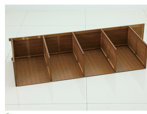
② Insert Large Back Panels (e) along the groove of Panels (d).