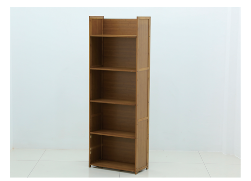
(5) Erect the Bookshelf.