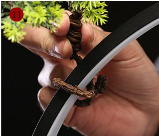
11 Simulated cypress wrapped around LED light ring