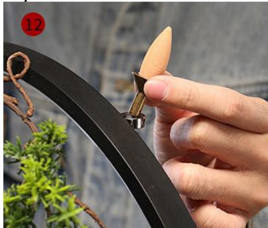
12 Place the incense on the lamp ring