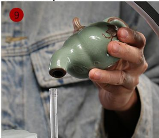
9 Teapot inserted into acrylic hose