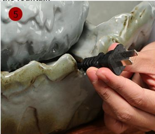
5 Pull the power plug of the pump out of the fountain