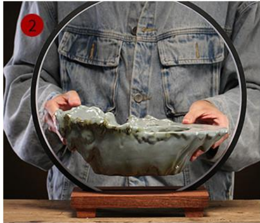
2 Place the reservoir smoothly on the solid wood base