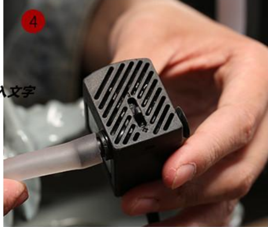
4 Connect the other end of the hose to the pump