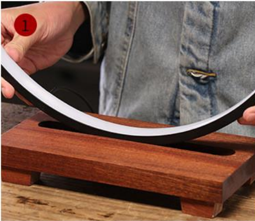
1 Lamp ring embedded in the groove of the solid wood base