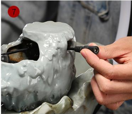
7 Nebulizer power connector pulls out of the water dispenser