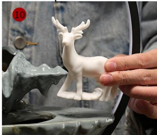
10 White deer ornament on top of water dispenser