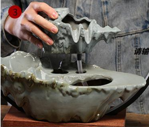
3 Connect the water hose to the spout of the fountain