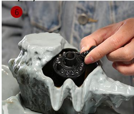
6 Place the atomizer into the spout of the water dispenser