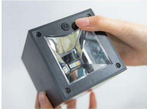
1.Press the switch before installation

Important hint! Please read this manual before installing this product.