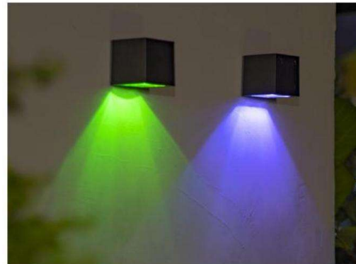
second gear color change