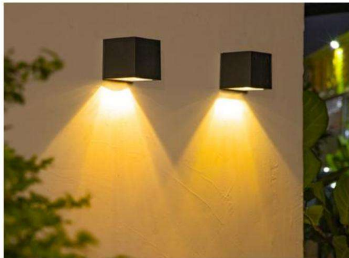
first gear warm light