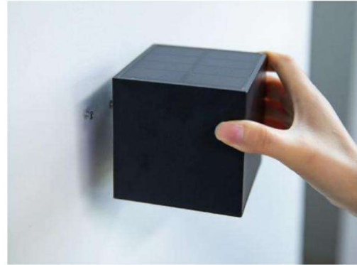
2.Drill holes for fixing with screws