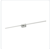
WS25350-BN Brushed Nickel