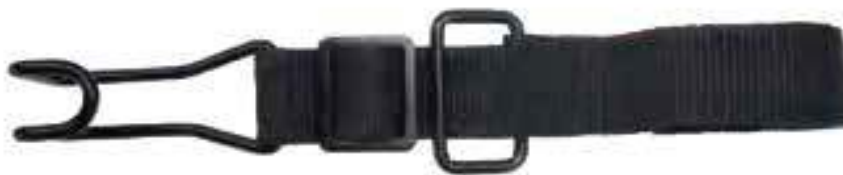
Strap With Buckle x 1