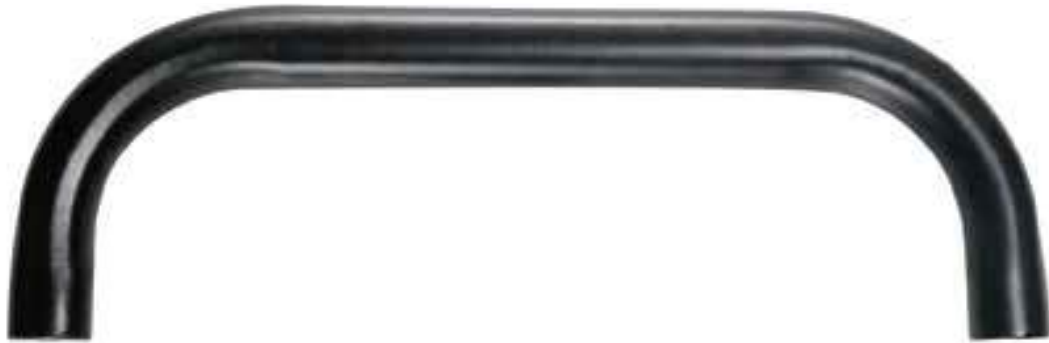
Retainer x 2