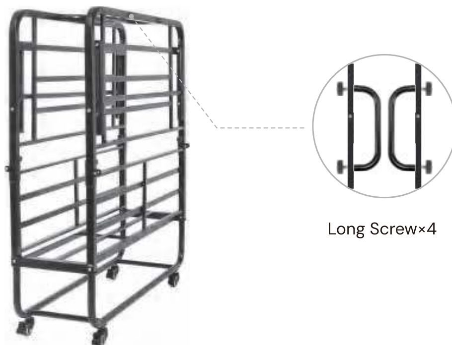
Long Screw x4

NOTE: Two of the retainers should be positioned opposite each other, pointing towards the middle.