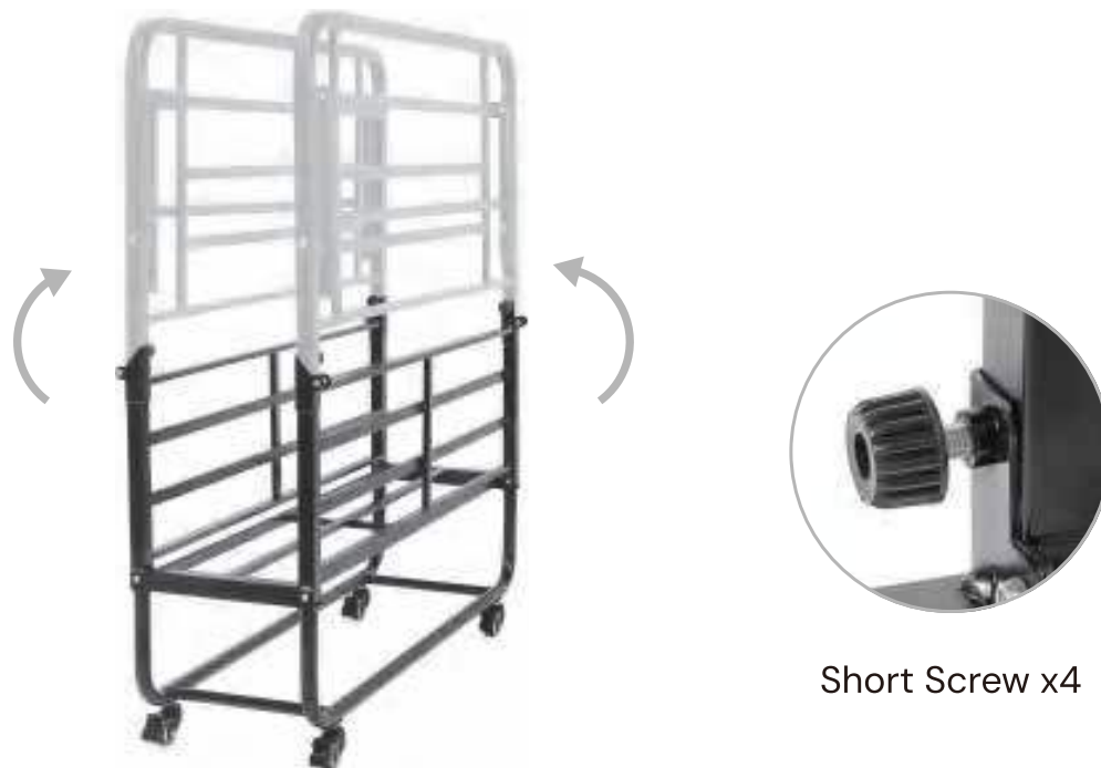
Short Screw x4

2. Unfold both sides of the bed frame upwards, ensuring it remains vertical, and proceed to install the 4 short screws.