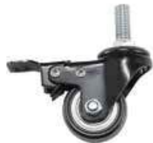
Wheel x 4