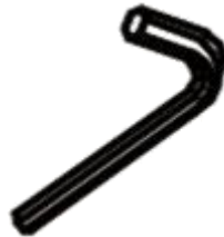
④: Allen Wrench (x1)