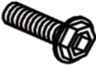
③: Screw (x8)