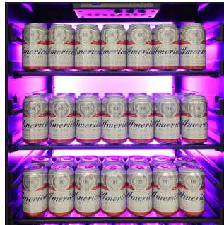
Cans Display on Shelves