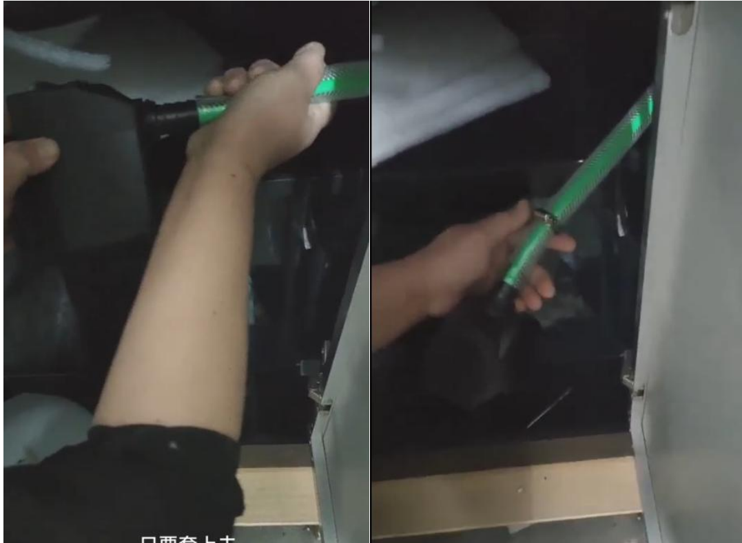
Place the water pump on the water pump pipe and tighten the clamp.