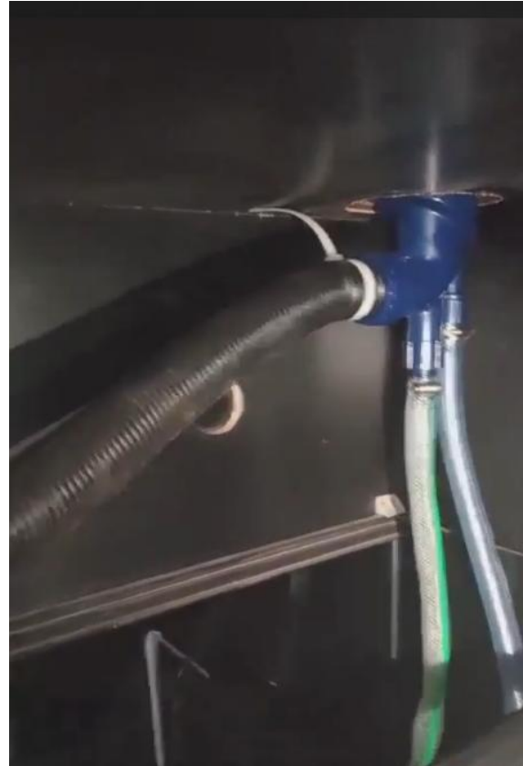
Black pipe inserted above the dry and wet separation box. The cabinet is installed with a diagram below.