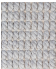
LIBR - Light Brown