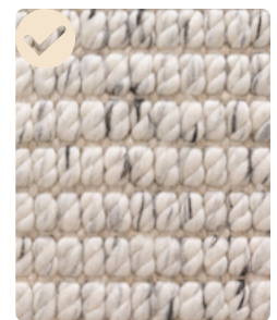
NATU - Natural