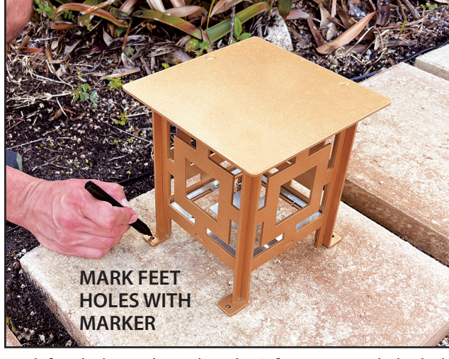
Mark feet holes with marker, don't forget to mark the hole for the low voltage wire to connect to the Lamp.