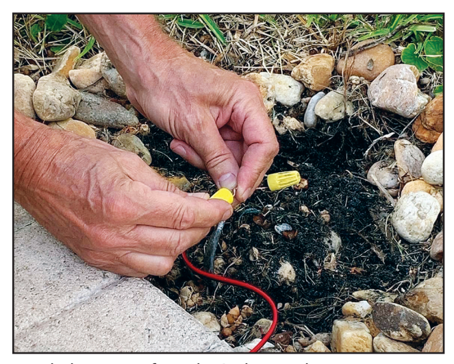
Attach the 2 wires from the Radiant Light to your new, or existing 12 to 15 volt, low voltage light system wire.