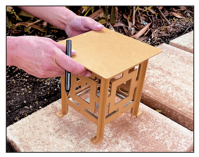
Locate where you want to install your Lights.