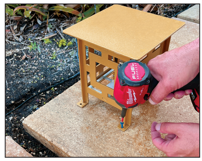
Attach to Deck, depending on your serface, wood, concrete, pavers etc. Any Hardware Store can direct you to the proper fastener type.