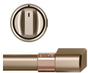
CXFCHHKPMBZ Brushed Bronze 2 handles; 6 knobs