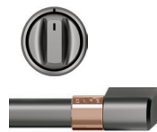
CXFCHHKPMBT Brushed Black 2 handles; 6 knobs