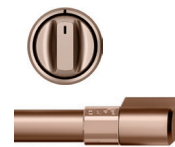
CXFCHHKPMCU Brushed Copper 2 handles; 6 knobs