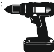
DRILL/POZI DRIVE SCREWDRIVER