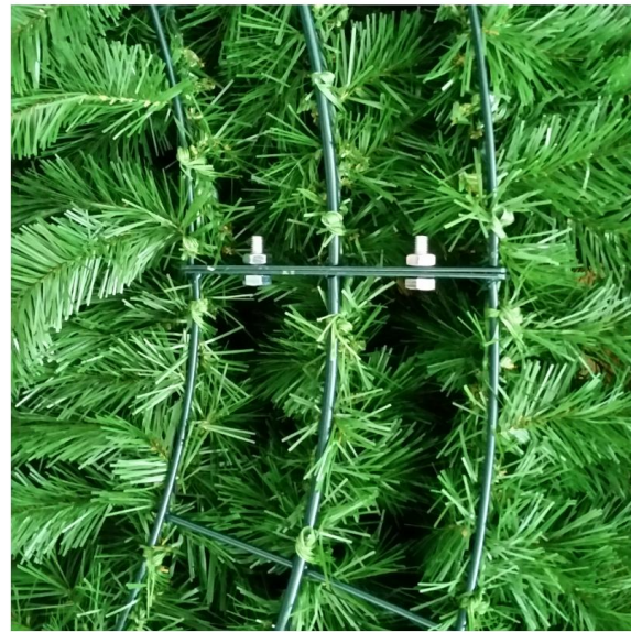
Commercial Grade Frame and PVC Noble Fir