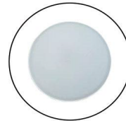
Headlamp with LED