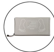
Foot Heating Plate