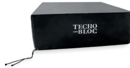
D. Protective cover

NON-INCLUDED ACCESSORY: Glass Wind Guard sold separately.