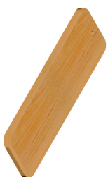
Seat Board 1 ea.