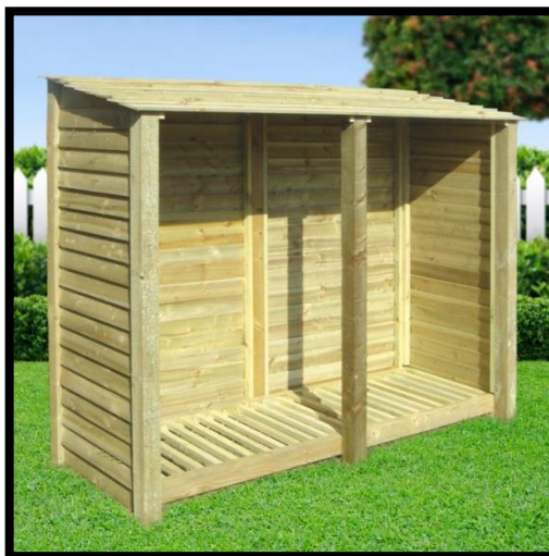
Normanton/Hambleton/Cottesmore log store

Electric screwdriver with No2 Pozidrive bit Or No2 Pozidrive Screwdriver