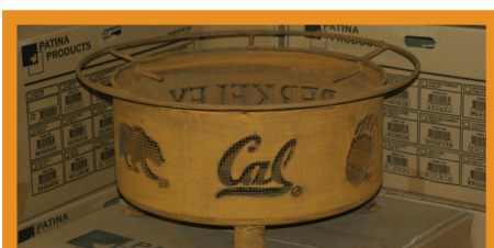
Fire pit with final finish.