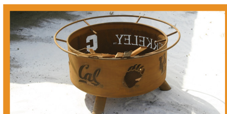
Cal fire pit ready for a burn.