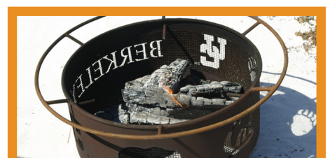
Color of the fire pit after a 1 hour burn.