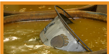
After washing fire pit is dipped into our secret sauce.