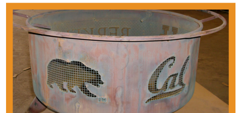
Fire pit in oxidation/patina phase - 1 hour later.