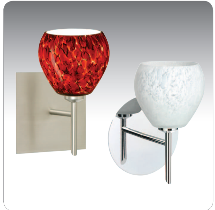
TAY TAY SHOWN IN GARNET (560541) WITH SQUARE CANOPY & CARRERA (560519) IN CHROME FINISH