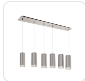
MP401432BN-06 Brushed Nickel