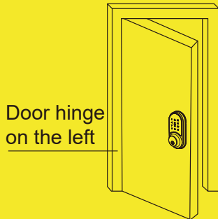
Left handed door