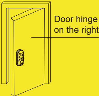
Right handed door