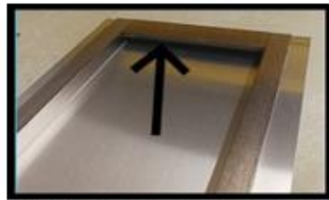
Lip for hanging over screw

For the single panel art, measure the distance between the first and second screw and repeat per number of desired screws.