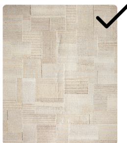
ZH02 - IVORY BEIGE