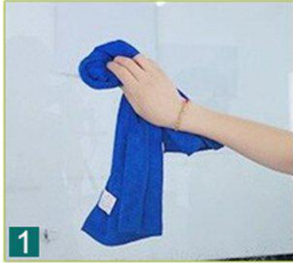
1 Clean Glass