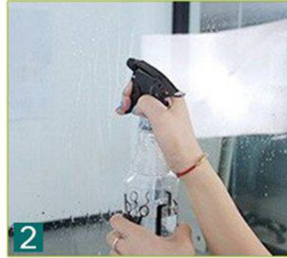
2 Spray a little soapy water on glass