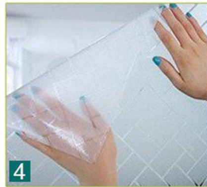
4 Apply film to glass