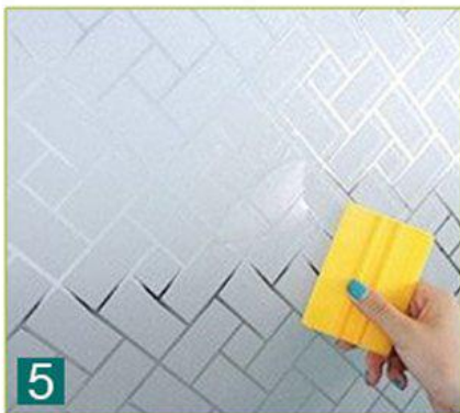
5 Squeegee away water and air bubbles