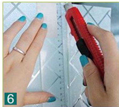
6 Cut off margins