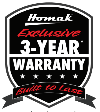
*See Warranty for exclusions and Limitations *Warranty Varies with Select Products