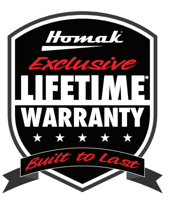
*See Warranty for exclusions and Limitations *Warranty Varies with Select Products