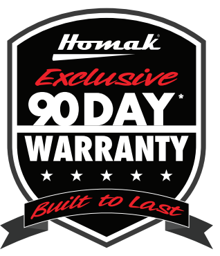
*See Warranty for exclusions and Limitations *Warranty Varies with Select Products