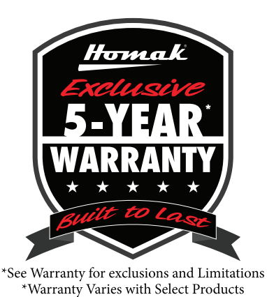
*See Warranty for exclusions and Limitations *Warranty Varies with Select Products