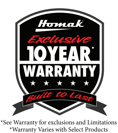
*See Warranty for exclusions and Limitations *Warranty Varies with Select Products