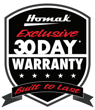
*See Warranty for exclusions and Limitations *Warranty Varies with Select Products