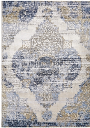
WHITE / LIGHT BLUE