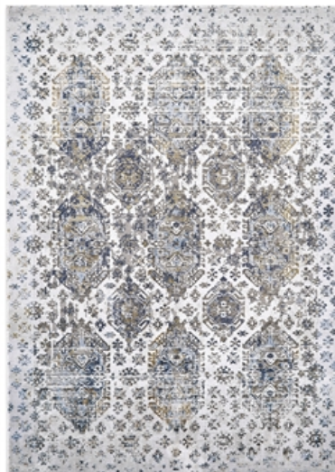
WHITE / GRAY