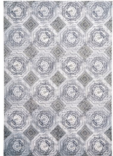
WHITE / STERLING