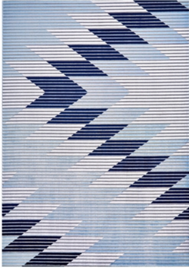
GRAY / LIGHT BLUE