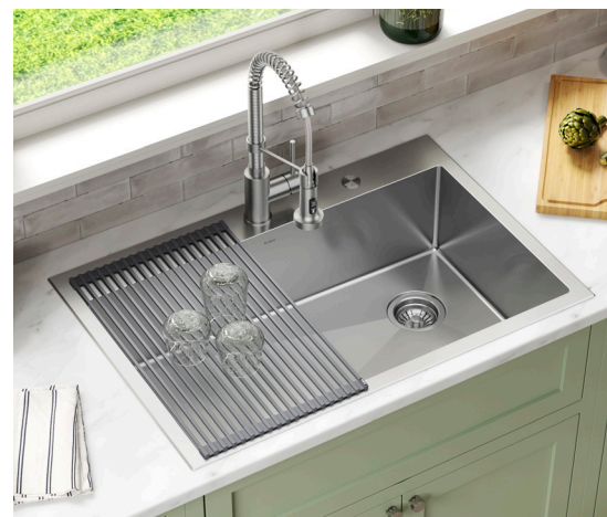
Loften™ Drop-In Sink (KHT410-33)