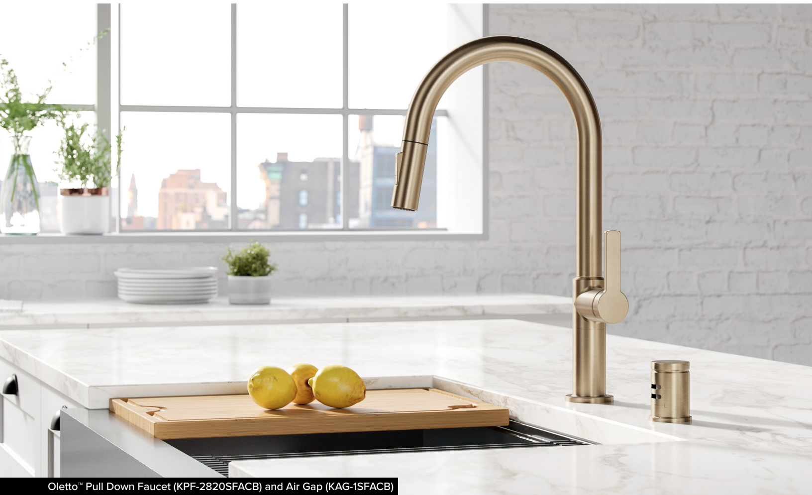
Oletto™ Pull Down Faucet (KPF-2820SFACB) and Air Gap (KAG-1SFACB)