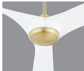
-640 Aged Brass/White