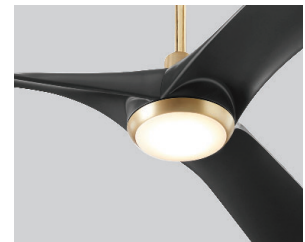
-1540 Aged Brass/Black