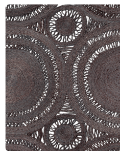
MH04 - GREY