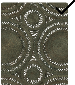
MH01 - OLIVE GREEN