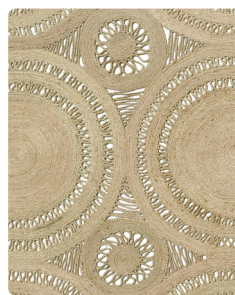
MH03 - BEIGE