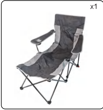
Camping Chair *1