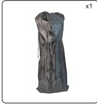
Storage Bag *1