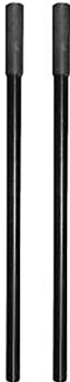
2 Long Metal Tubes with Joint Connector