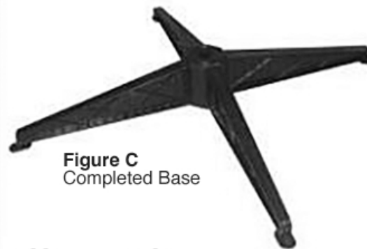
Figure C Completed Base