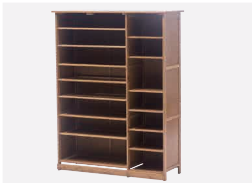
⑨ Secure Bottom Slat (p) with Medium Screws (y).