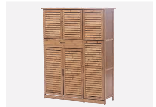
⑫ Insert the cabinet.