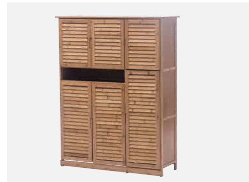
⑪ Install rest of the doors.