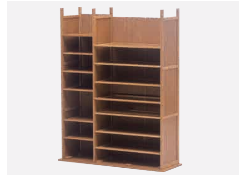
⑦ Insert Back Slat (o) to slot.

© 2020-2021 by Pundarika LLC - MoNiBloom.com