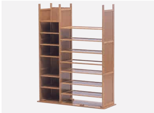
⑤ Insert Long Back Panel (l) to slot.