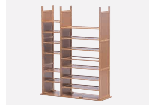
④ Position and secure rest of the Panels (j)(m) with Large Screws (x).