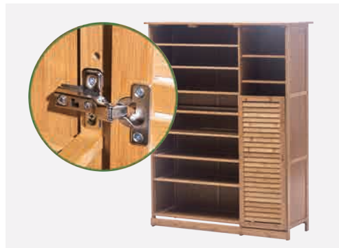
⑩ Position Doors (d)(e)(f)(g)(h) with Hinges, secure on rack with Small Screws (z).