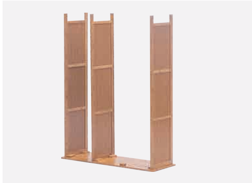
① Position Frames (a)(b)(c) on Top Panel (q), secure with Large Screws (z).