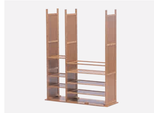
③ Position and secure Cabinet Support Frame (w) with Large Screws (x).