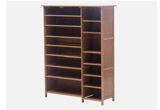
⑧ Secure Bottom Panels (j)(n) with Large Screws (x). Then reverse the rack.

© 2020-2021 by Pundarika LLC - MoNiBloom.com