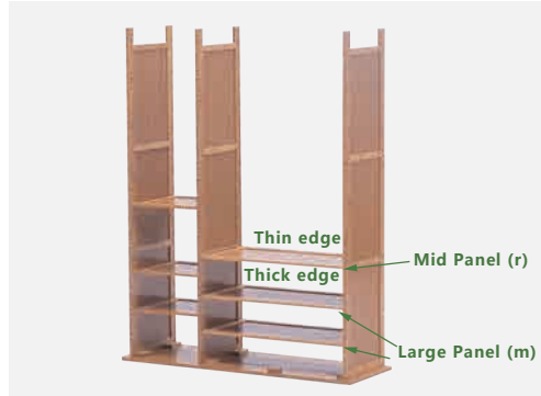
② Secure Panels (j)(m)(r) with Large Screws (x) as picture shown.