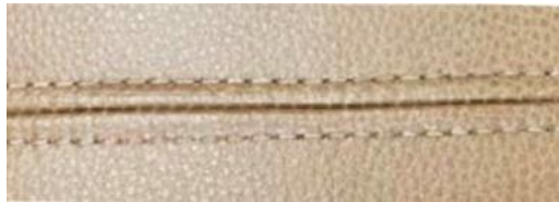
Slight Shade Variation