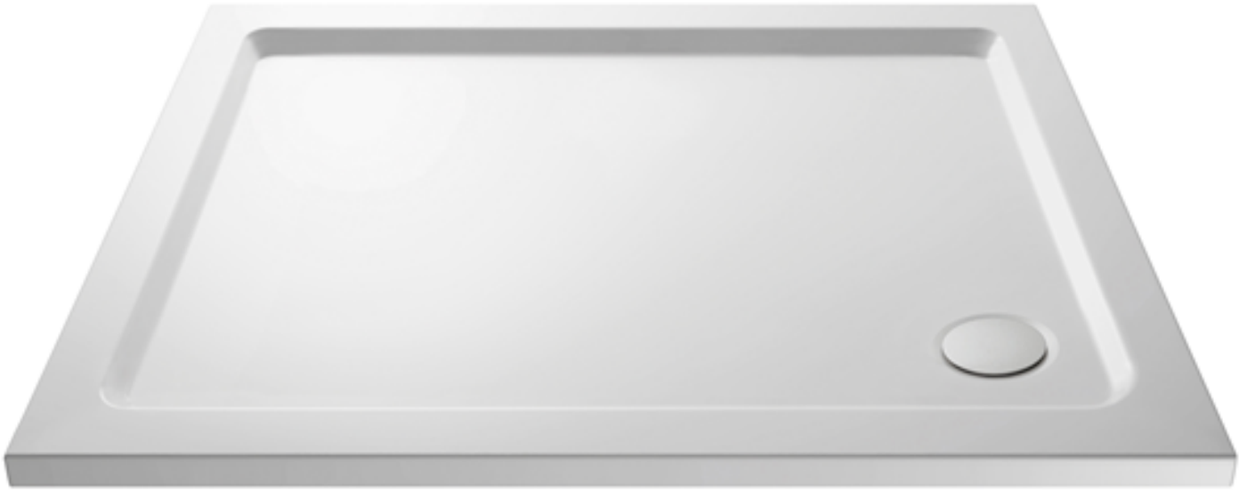
1000 x 800 RECTANGULAR TRAY