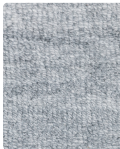
PU03 - GREY