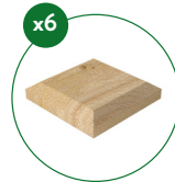
x6 Decorative Caps

Short Posts Stacked on top of Tall Posts