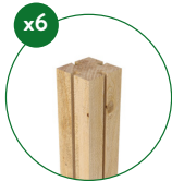
x6 11 in. x 2.5 in. x 2.5 in. Tall Posts